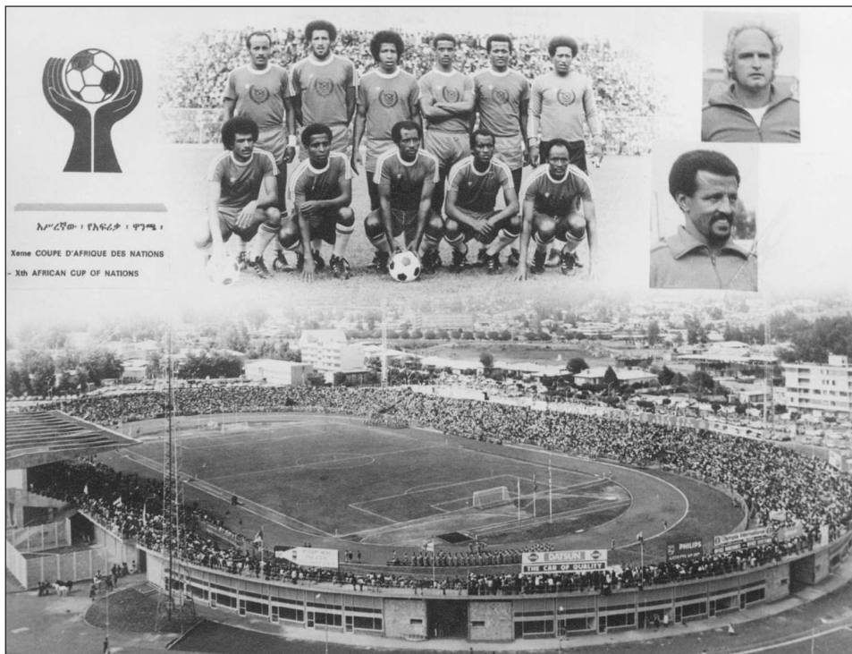
Image 2: Addis Ababa Stadium during the 10th African Cup

With (re-)construction of a modern stadium in the heart of the Ethiopian capital, the country met the requirements to host major tournaments. The establishment of the African Nations Cup in 1957 offered new possibilities to put the nation on the sportive landscape. In 1962, Ethiopia had been chosen for the game. The country invested heavily into stadium construction, especially in Dirre Dawa and Asmara where some of the matches were played. In 1976, when the 10th African Cup was hosted by Ethiopia, the seating capacity of the Addis Ababa Stadium, as it was now called, was increased to host 36,000 people. In the preparation of the event the government decided to clean up around the stadium.