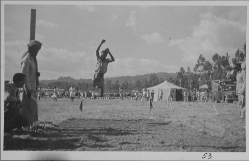
Image 1: Army Sports at Medfegna Gebi, late 1940, courtesy of Library of the Institute of Ethiopian Studies, Addis Ababa

particular notions of ‘useful’ (as well as ‘harmful’) recreation. Stadiums, as part of a rapidly transforming urban sport structure, were inculcated and manifested specific ideas of progress in a period called “Ethiopian modernity”. This period is especially associated with Ras Teferi, later Emperor Haile Selassie I, whose name the first Ethiopian stadium took 4 .